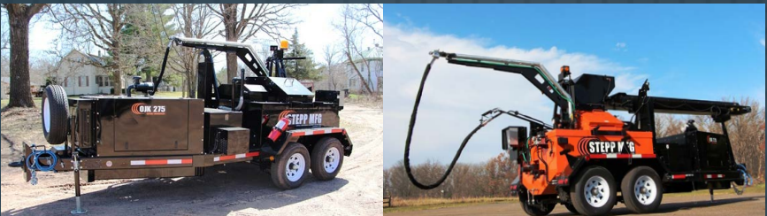
Rubberized Crack Sealing

Optional equipment includes: 100CFM air compressor, auto loader, overnight heaters, and an on demand pumping system.