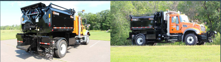
Hook Mounted Pothole Patching

Stapp's STPH Hook Style Patch Bodies have all of the great features of the chassis mounted units with the versatility of the hook lift system. With the rising costs of trucks, the hook lift system allows you to utilize your fleet for demands other than patching. The STPH Hook Style Patch Truck can be set up to accommodate any brand of hook lift system.