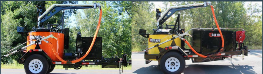
Rubberized Crack Sealing

Optional equipment includes: 100CFM air compressor, auto loader, overnight heaters, and an on demand pumping system.